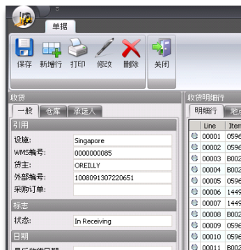
Sample Chinese Layouts – Each user group can have its own user defined language GUI

<InitialCaption>单据类型</InitialCaption> <RibbonDocumentCaption>单据</RibbonDocumentCaption> <SubmitButtonCaption>保存</SubmitButtonCaption> <AddDetailLineButtonCaption>新增行</AddDetailLineButtonCaption> <PrintButtonCaption>打印</PrintButtonCaption> <EditButtonCaption>修改</EditButtonCaption> <DeleteButtonCaption>删除</DeleteButtonCaption> <CloseButtonCaption>关闭</CloseButtonCaption> - <HeaderGroupControl> <Visible>True</Visible> <Caption>收货</Caption> - <TabPage> <Caption>一般</Caption> <Visible>True</Visible> - <GroupControl> <Caption>引用</Caption> - <TextControl> <Name>WHSEID</Name>